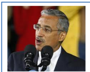
Bobby Scott, incoming Ranking Member of the House Committee on Education and the Workforce

At the helm of the House Education and the Workforce Committee will be a familiar face, Rep. John Kline (R-MN), who easily recaptured his seat, even after being targeted by liberal HBO personality Bill Maher's "flip a district" effort. With the departure of Congressman George Miller (D-CA), the top Democrat on the committee, who is retiring at the end of the year, Congressman Bobby Scott (D-VA) is expected to fill the slot of the Ranking Member.