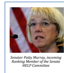
Senator Patty Murray, incoming Ranking Member of the Senate HELP Committee

Although Senator Barbara Mikulski (D-MD) is next in line to serve as Ranking Member of the Senate HELP Committee, she is more likely to become Ranking Member of the Senate Appropriations Committee, thereby positioning Murray as Ranking Member of the Senate HELP Committee.